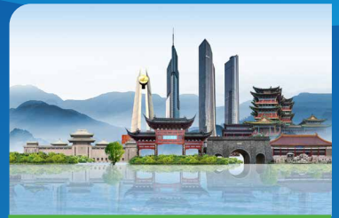
Nanjing, China | July 12-14, 2024

ICSIP was held successfully in Beijing (2016, hosted in North China of Technology), Singapore (2017, hosted in Nanyang Technological University), and Shenzhen (2018, hosted by Shenzhen Research Institute, Southeast University, China), Wuxi (2019, hosted in Southeast University in Wuxi), virtual conference due to COVID-19 (2020, hosted by School of Cyber Science and Engineering, Southeast University), Nanjing (2021, hosted by School of Cyber Science and Engineering, Southeast University), Suzhou (2022, hosted by Suzhou Campus, Southeast University) and Wuxi (2023, hosted by Southeast University in Wuxi). The aim of ICSIP 2024 will bring together the researchers, experts, and scholars from Asian Pacific nations, North America, Europe and around the world to exchange their research results and address open issues in signal and image processing. It is one of the leading international conferences for presenting novel and fundamental advances in the fields of signal and image processing.